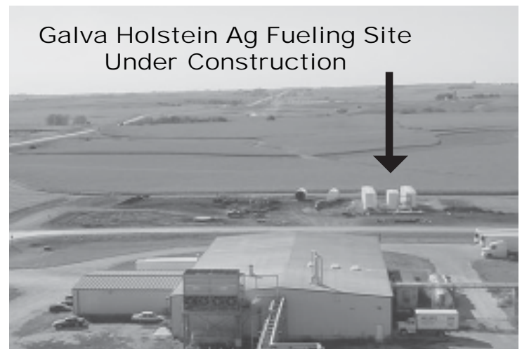
Galva Holstein Ag's new retail fueling site is located across M-25 and directly west of Quad County and Heller's.

Galva Holstein Ag is constructing a retail fueling site and bulk fuel facility 1 ½ miles south of Galva on Highway M-25 (just off Highway 20). Retail pumps will include a #2 clear high-speed pump with a slave pump to enable trucks to fill both tanks at one time. In addition, there will be #1 clear diesel for winter blending, two E10 (gasohol) pumps and one E85 pump. Quad County Corn Processors is happy to be associated with this project and will be supplying E85. "Barring any unexpected construction or weather-related delays, Galva Holstein Ag anticipates pumping fuel by late October 2004", states Delayne Johnson, manager of Galva Holstein Ag.