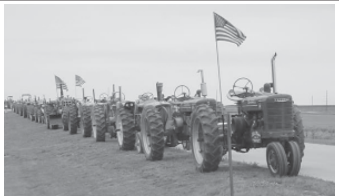
Quad County Corn Processors hosted the Sac County Tractor Ride participants on July 24. Their event, held in conjunction with Early's Crossroads Days included a tour of the plant.

If you have any specific income tax questions, we recommend that you see your tax advisor prior to the end of the year.